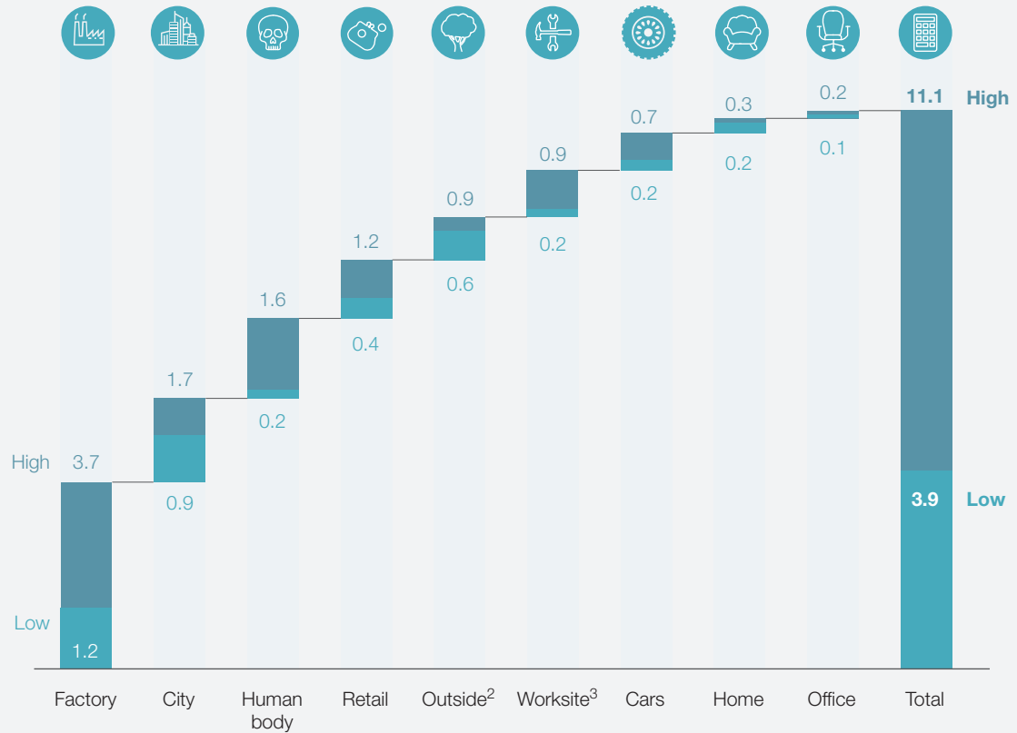
Potential economic impact by segment, 1 $ billion (2015 dollars)